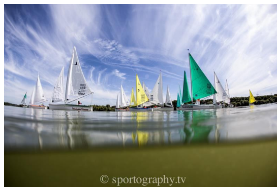
A stunning photo taken at Burghfield