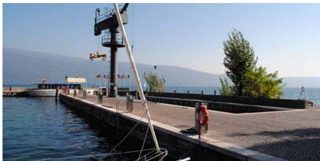
Club Marina (SKUD location?)