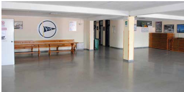
Training Room (Sail Measurement)