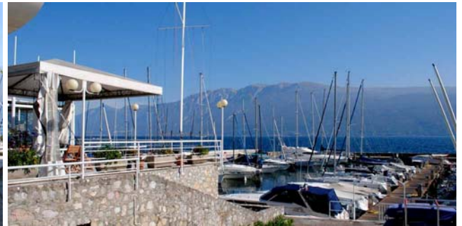
CVG Café deck & marina