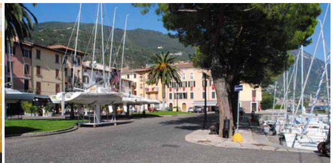
Bogliaco Town Square (& old harbour)