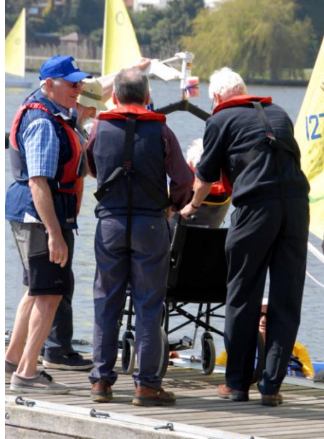
The hoist in use – day one 2008.

Our hoist was serviced just before we started sailing and is in regular use each week. To make the transfer of sailors from wheel chair to boat more efficient and to avoid delays more purpose made slings have been obtained with some being purchased by a local charity.