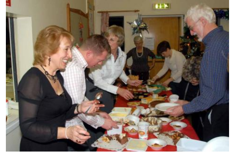
Many hands make light work.