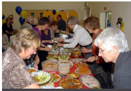
Plenty to eat!!