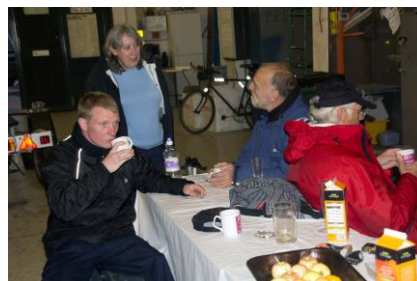
A cup of hot sweet tea works wonders after such a day!