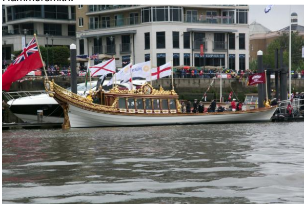
One of the Royal Barges.

The Rutland boat reached its start point with the rest of the Recreational Motorboat Squadron at 11.45.