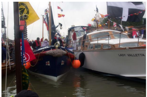
Note the web cam mounted on the mast. The boat was sending images every 5 seconds to the Rutland Sailability web site.