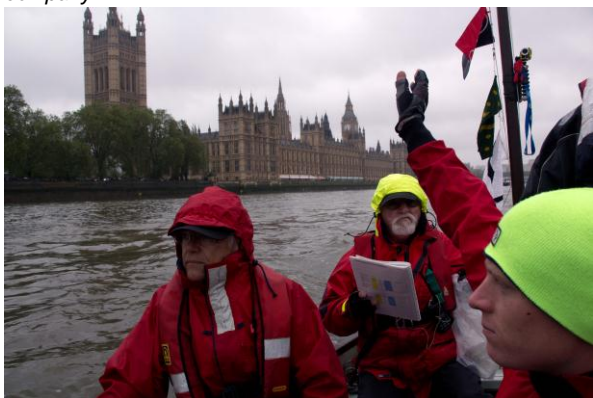
Passing the Houses of Parliament on the way to Hammersmith.