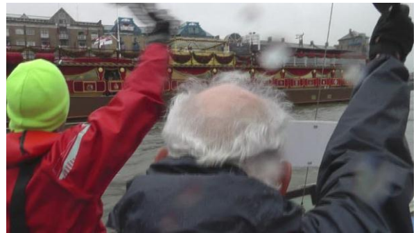
Three Cheers for Her Majesty the Queen