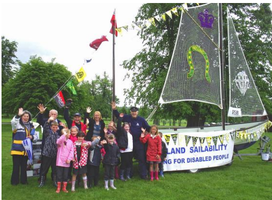
Some of the children who made the bunting for the boat visited the stand.