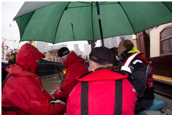
In the lock with some large Dutch Barges. Some rather scary company.

There were 1,000 boats in the Pageant, divided into Squadrons. The Rutland boat was in the Recreational Motorboat Squadron, towards the back of the fleet. Along with around 150 other boats, the Rutland boat went through West India Lock at around 09.00 and started out for the mustering point, 15 miles upstream just below Hammersmith Bridge. It was already raining!