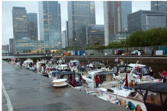
All was not over. Now came two and half hours to get back through the Lock at West India Docks.